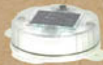
COLOR: clear ITEM#: 5012