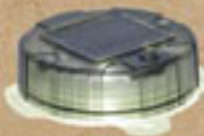
COLOR: smoke ITEM#: 5013