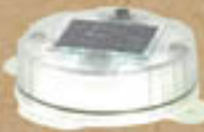
COLOR: clear ITEM#: 5012